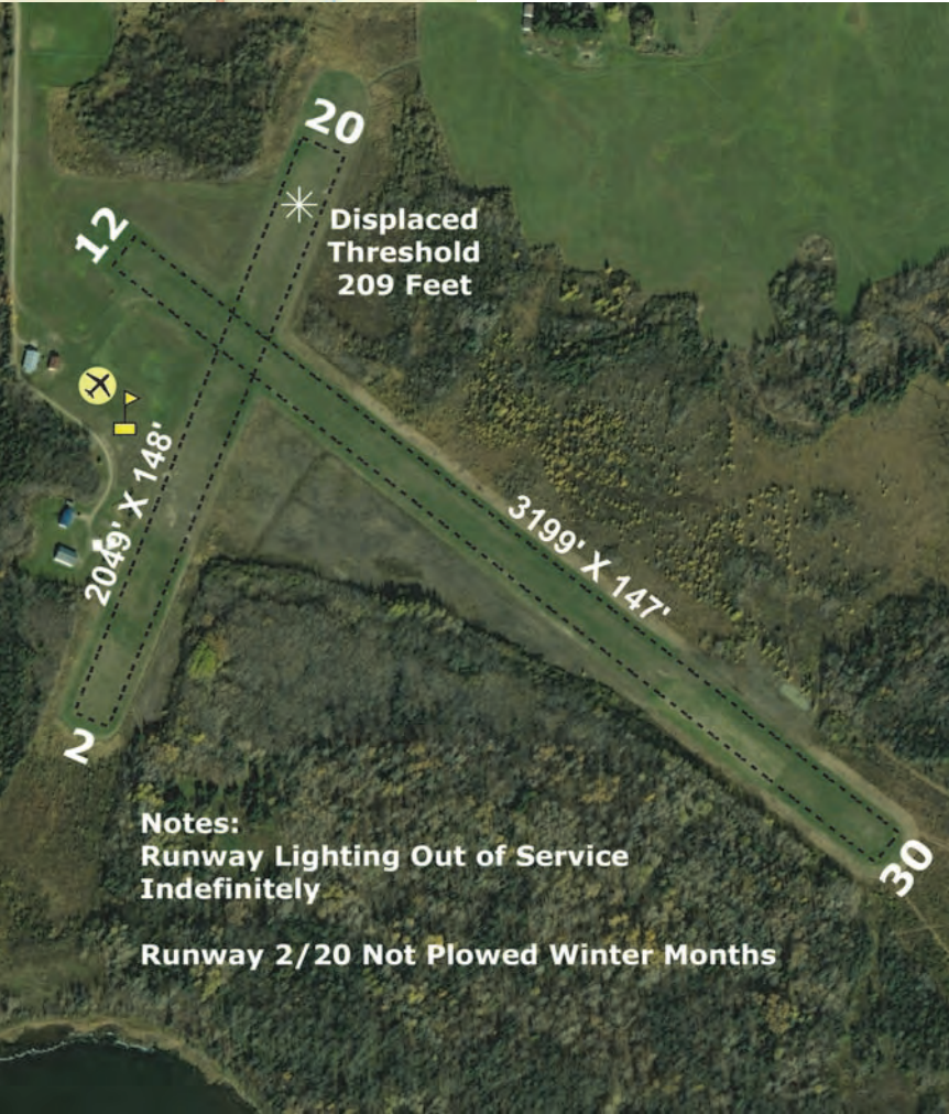
Northome Municipal Airport

SEC. CH: TWIN CITIES LAT: 47-53-29.842N LONG: 094-15-00.802W Approaches: Visual Only COMM: 122.9 CLNC DEL: 651-463-5588